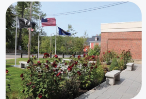
★ Remembrance Garden

Paying homage to a sometimes forgotten aspect of World War II. Produce grown in the Wright's Victory Garden benefits the local food pantry.