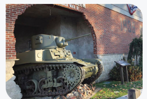
★ Stuart Tank