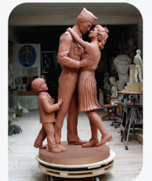
★ The Homecoming